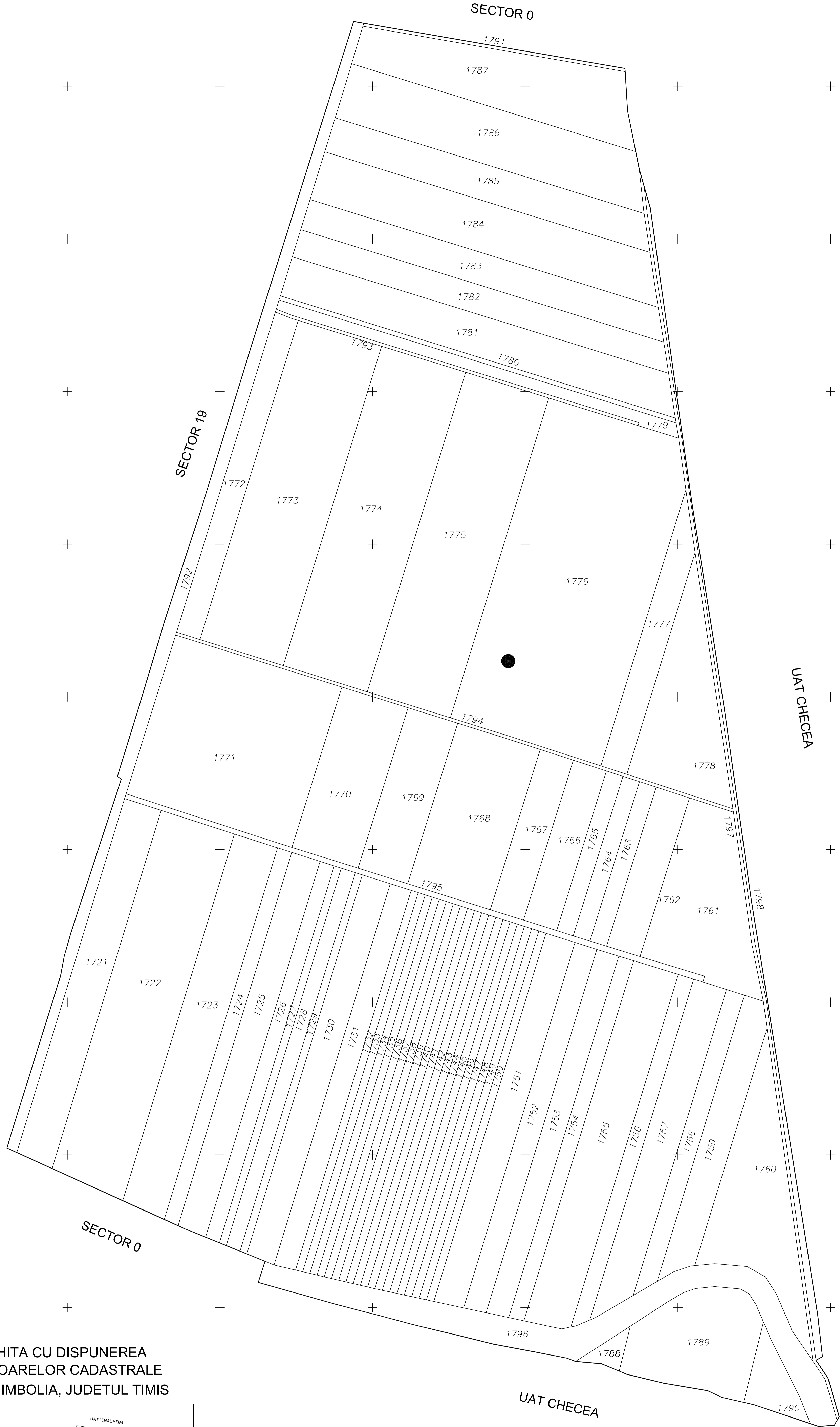
SCHITA CU DISPUNEREA SECTOARELOR CADASTRALE U.A.T. JIMBOLIA, JUDETUL TIMIS