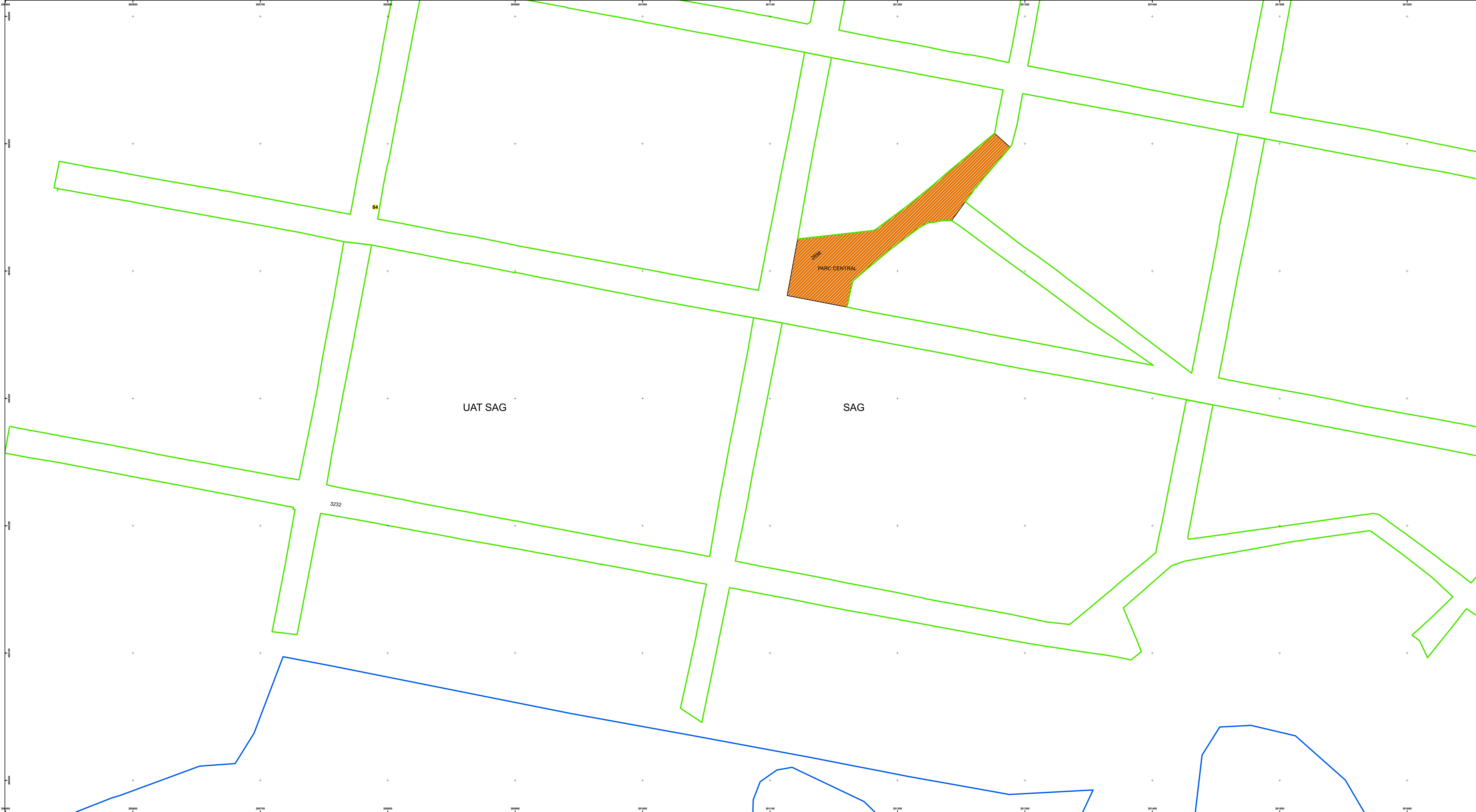
Schita cu dispunerea sectoarelor cadastrale