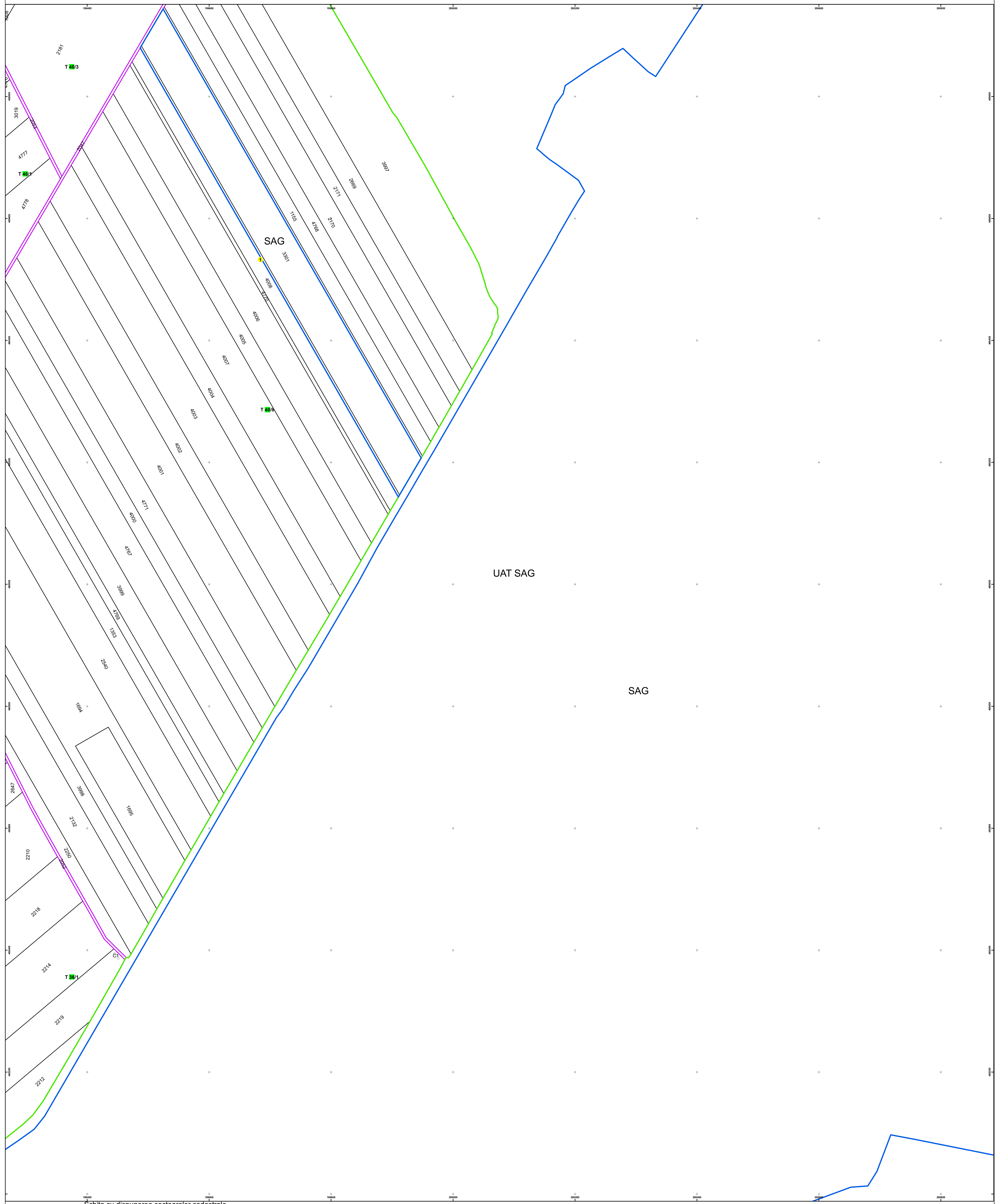
Schita cu dispunerea sectoarelor cadastrale