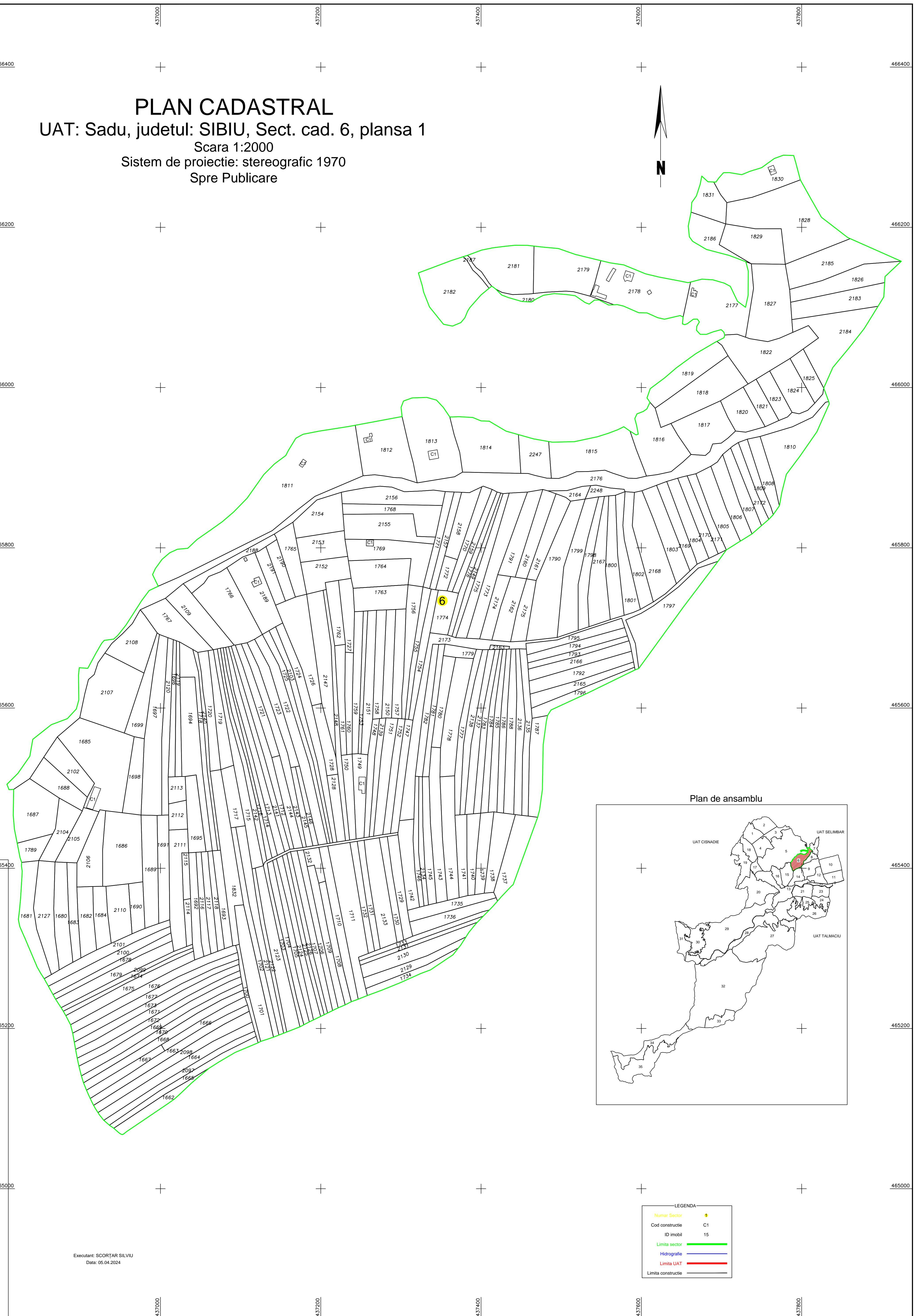
Plan de ansamblu