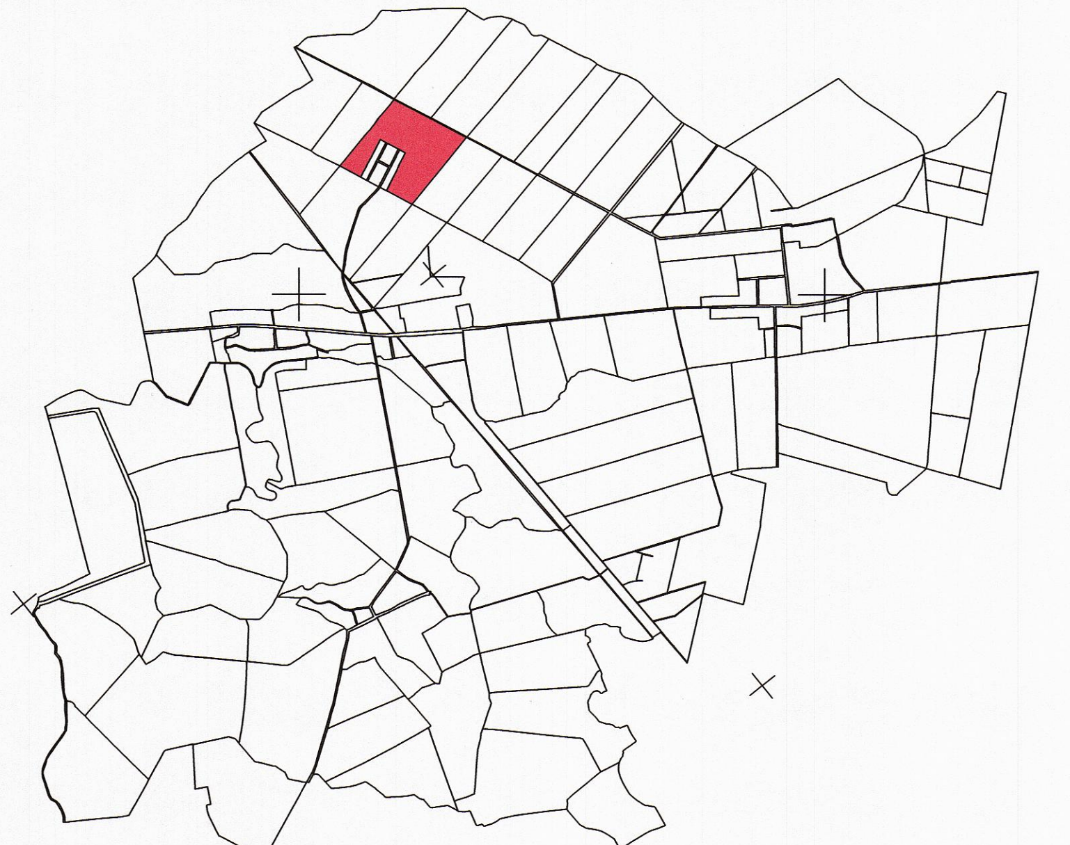
DISPUNEREA SECTOARELOR CADASTRALE IN CADRUL UAT