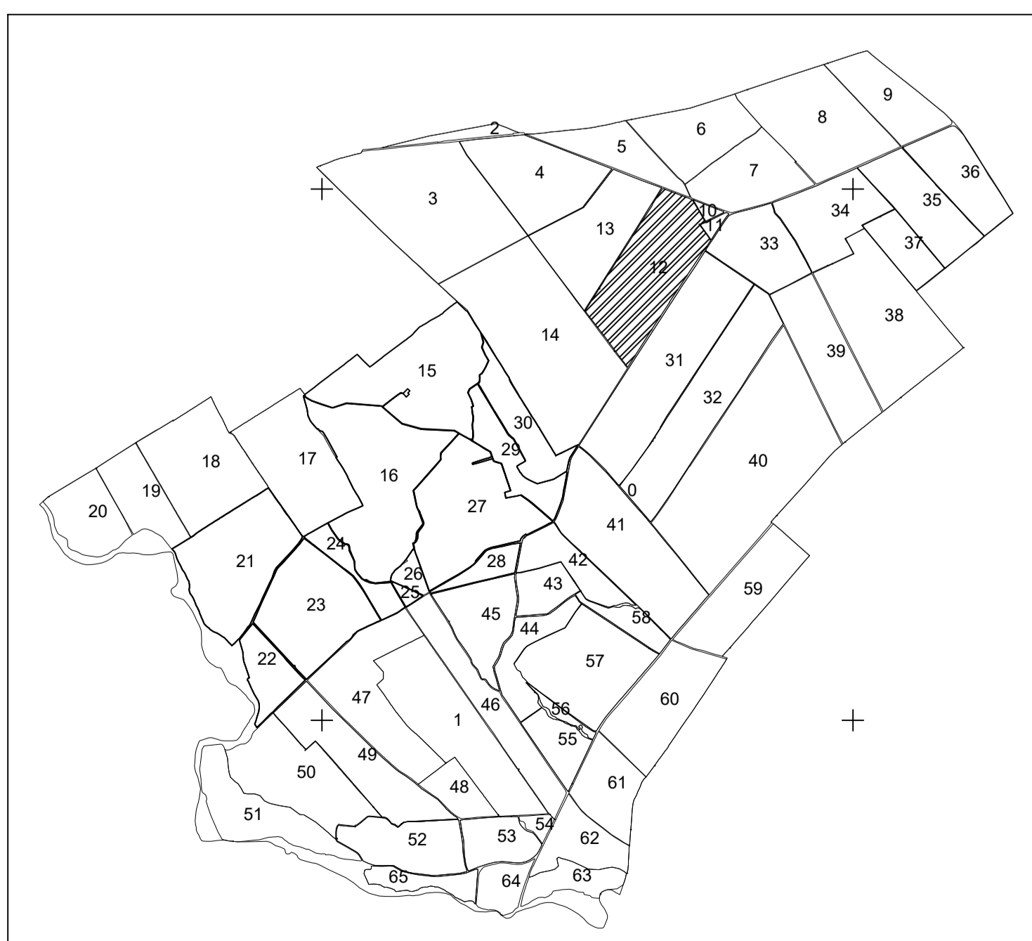
SCHEMA DE DISPUNERE A SECTOARELOR CADASTRALE

Executant: SC TOTAL BUSINESS LAND SRL Data: 16.09.2024