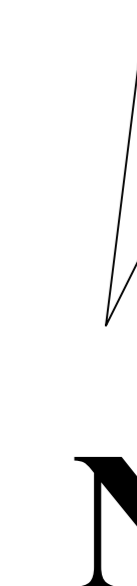
Schita cu dispunerea sectorului

Scara 1:2000 Sistem de proiectie STEREO 1970 Plansa 20