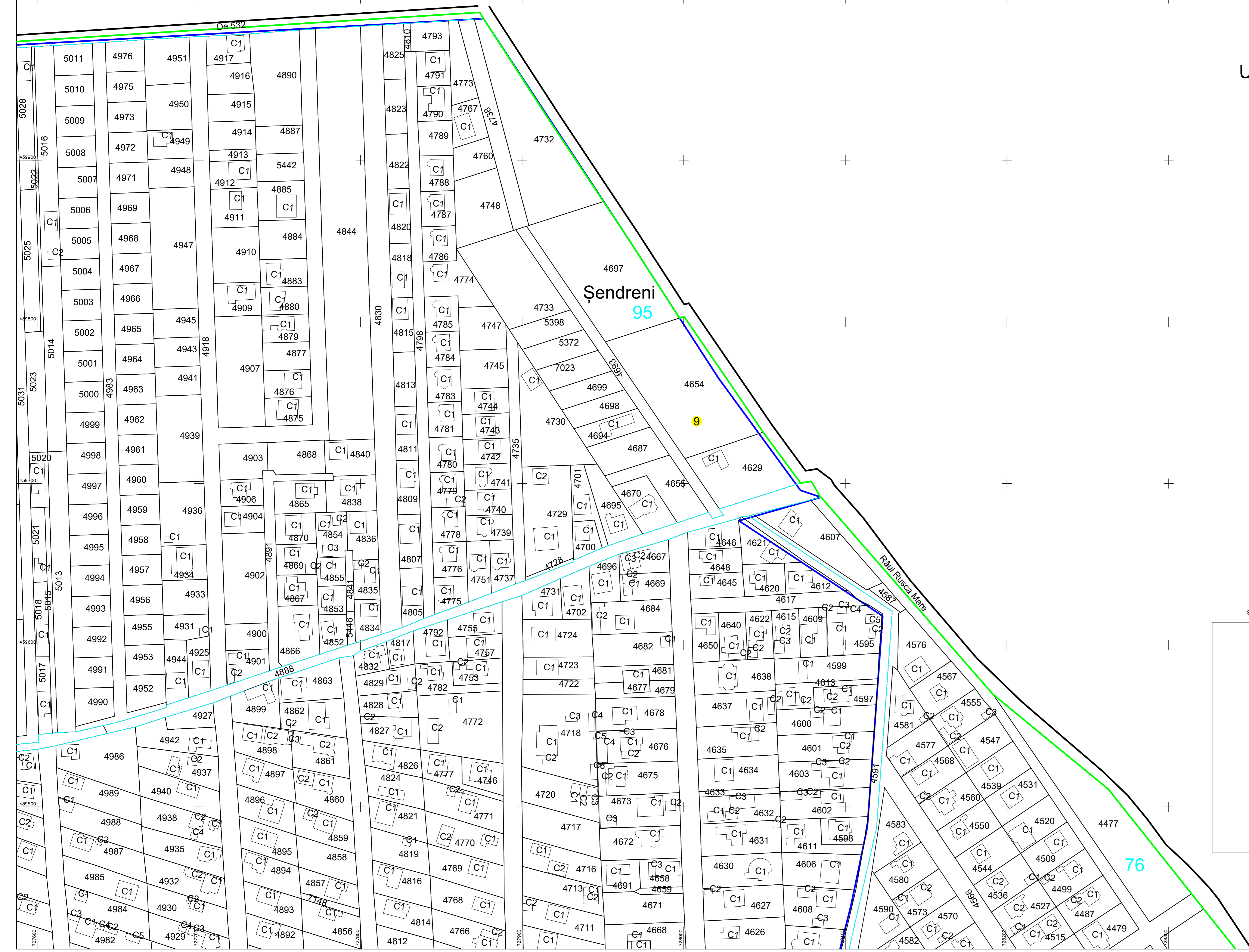
SCHEMA DE RACORDARE A PLANSELOR