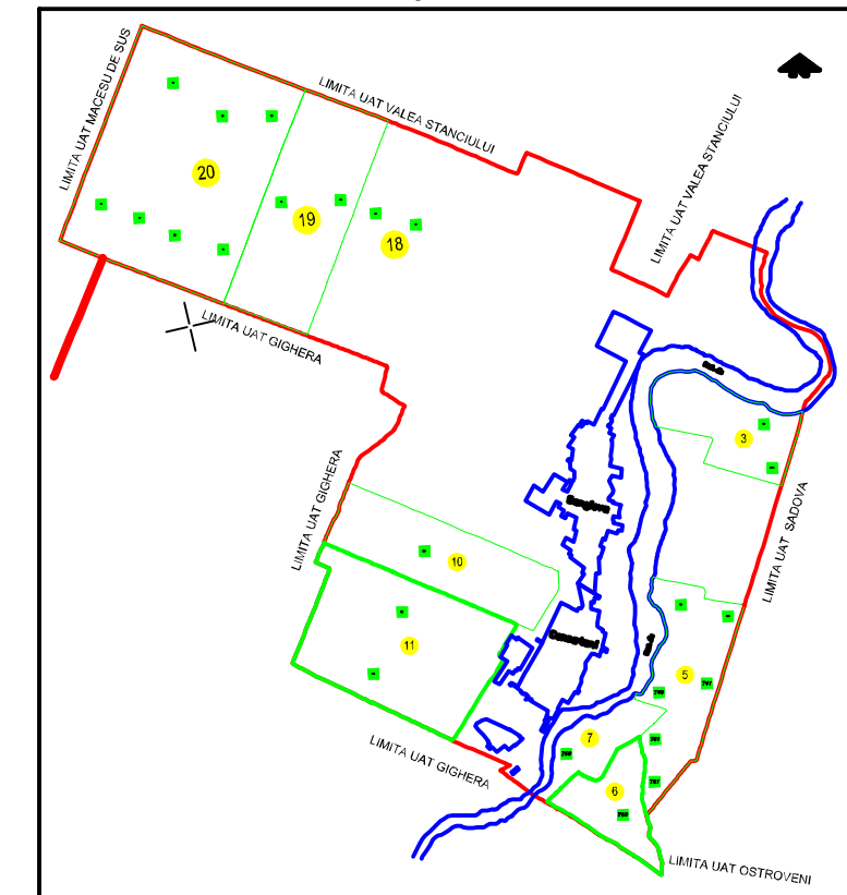
Schita dispunere sectoare