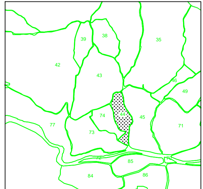
Schita de dispunere a secoarelor